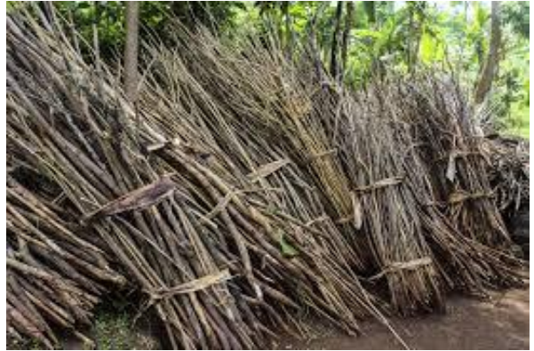
A pile of firewood for sale. High demand of firewood is increasing pressure on forests