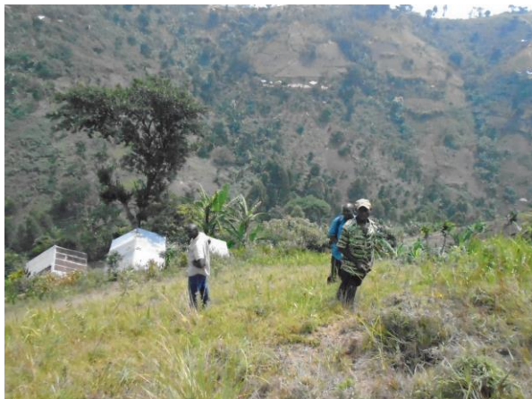
Project staff inspecting a planting plot

In 2022, Defenders of the Planet was manned by a team of 138 members, who were experienced social workers, environmentalists, accountants, agriculturalists, health experts and dedicated paraprofessionals. They are truly the life-blood of the organization, keep it invigorated and growing. Driven by DEPLA's values and commitment to excel in the field of environmental conservation, the team members served as the backbone of all the projects being implemented by it in partnership with other organizations. Our team is gender balanced and it is ensured that no one is discriminated on the basis of race, religion or gender.