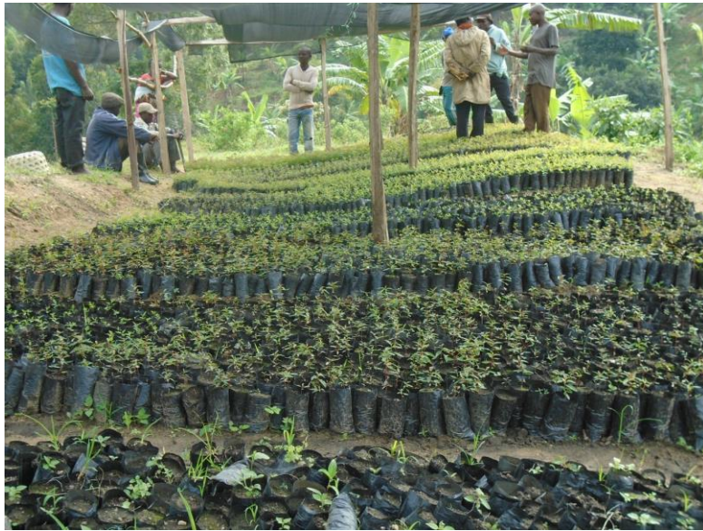
Project staff inspecting a tree nursery bed at Kinyateke